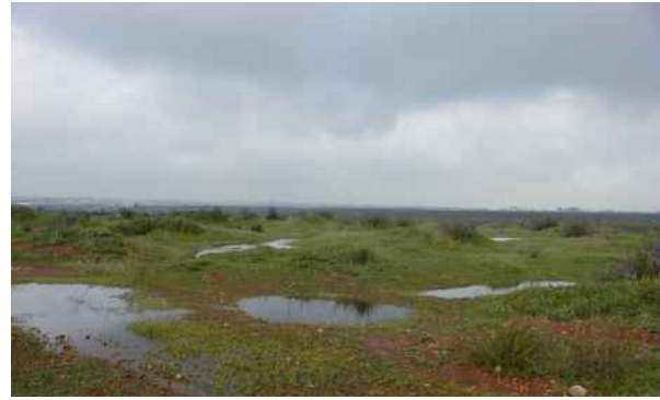
Vernal Pool Habitat – One of the Station’s most important sensitive resources Natural Resources Division